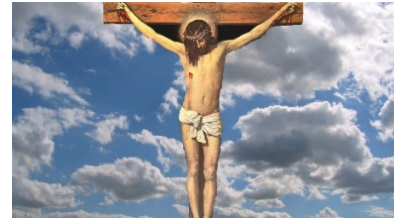
Make a joyful noise unto the Lord, all ye lands. (Psalm 100 vs 1)