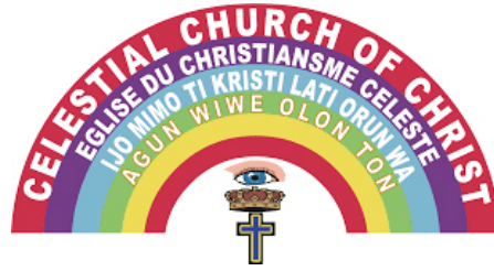
REGION B GREAT LAKE'S USA DIOCESE